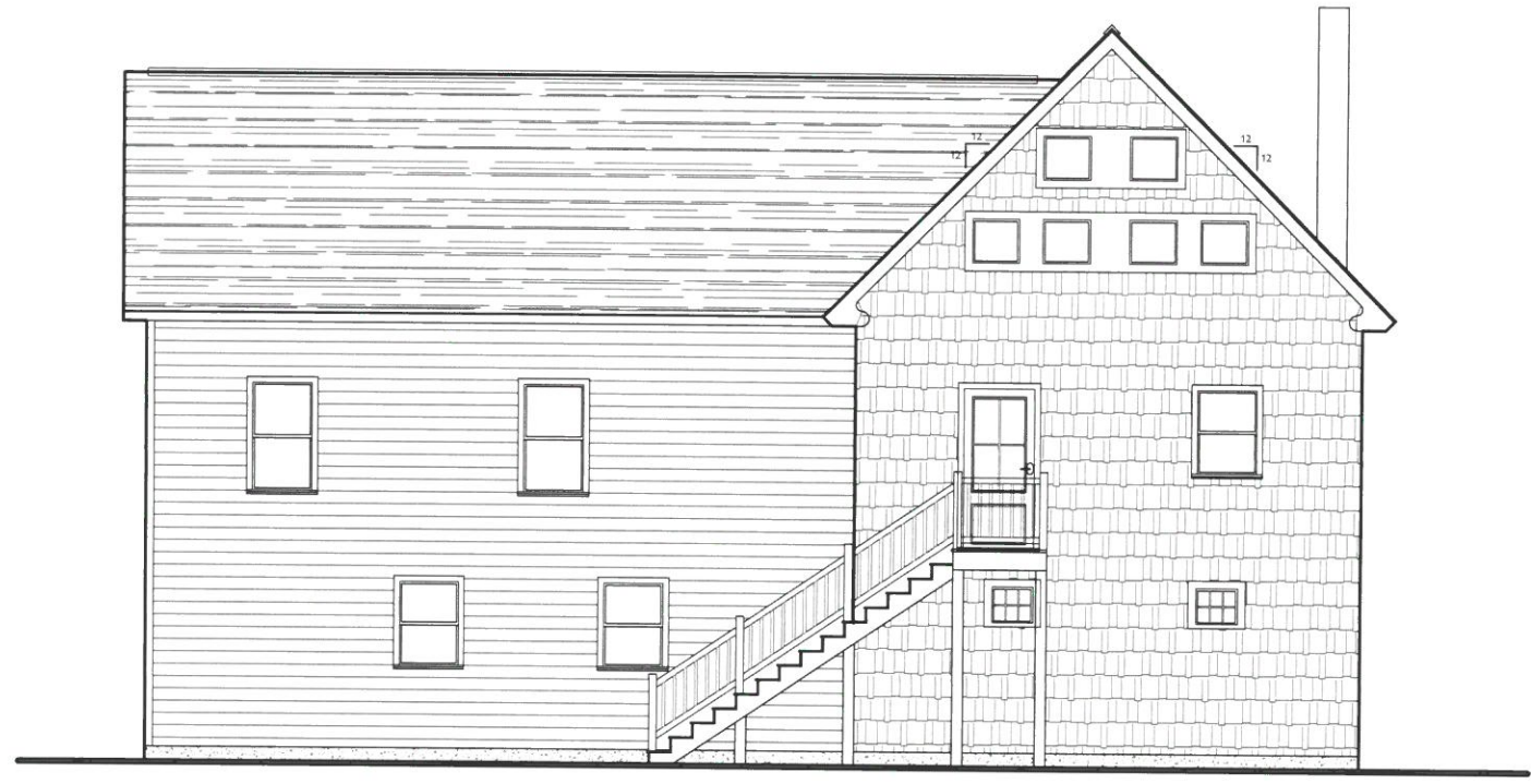
○ Rear Elevation Scale 1/4" = 1'-0"