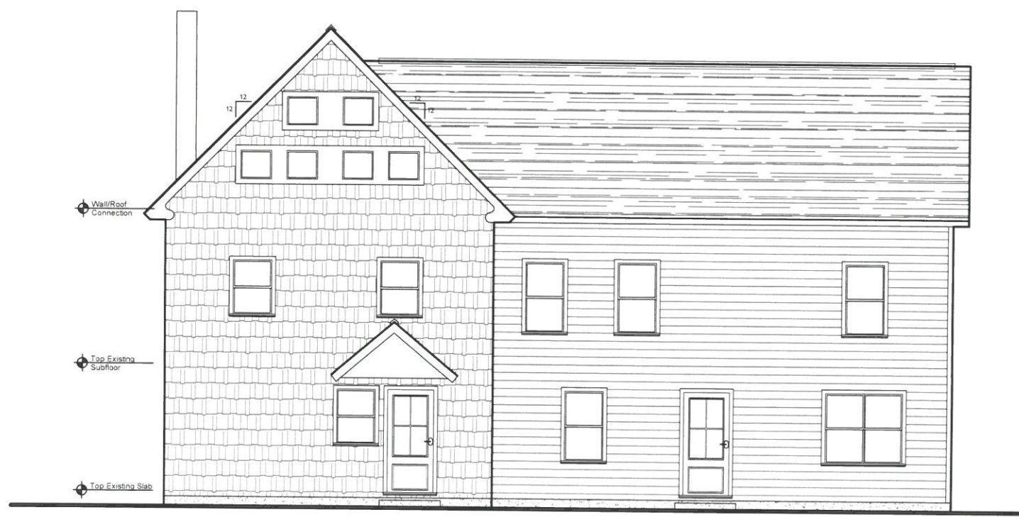
○ Front Elevation Scale 1/4" = 1'-0"