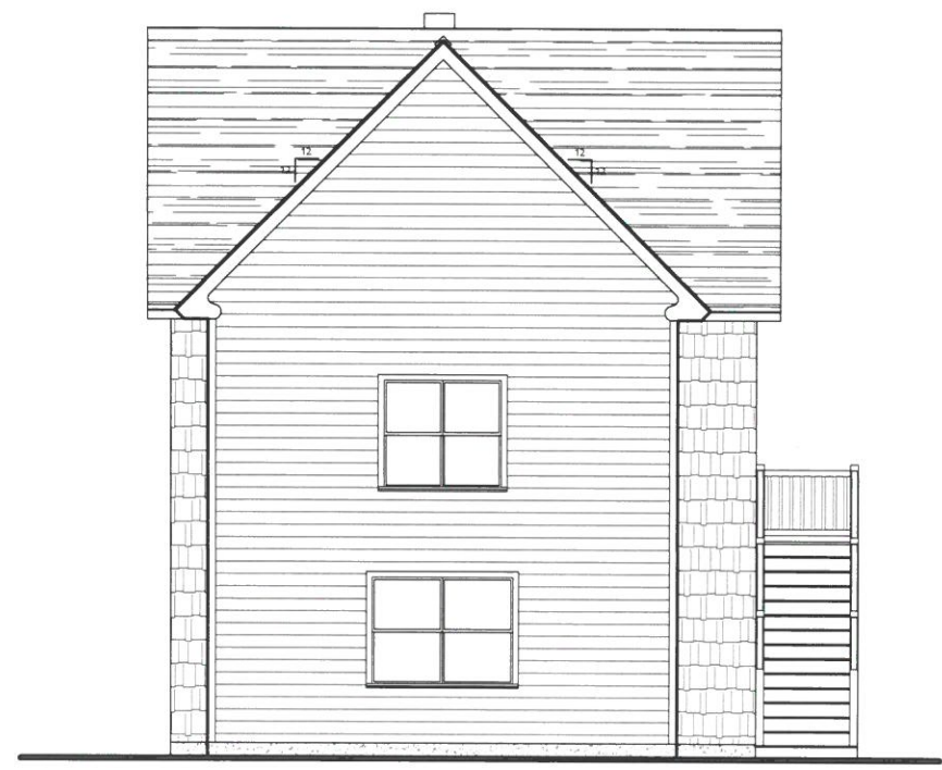
○ Front Elevation Scale 1/4" = 1'-0"